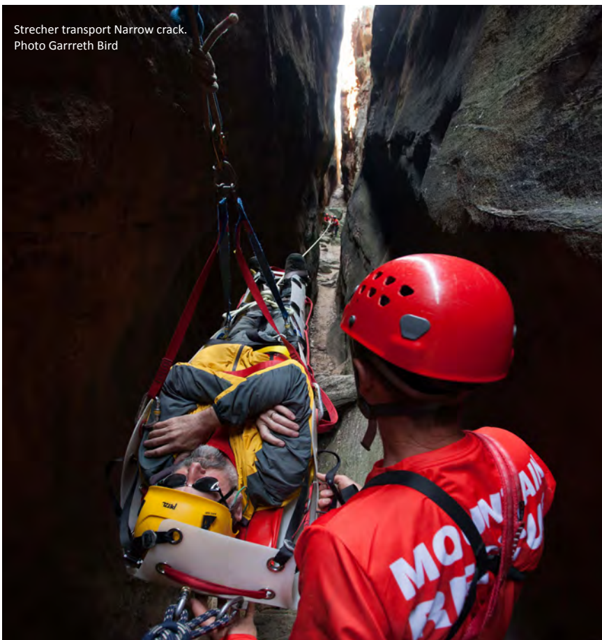
Stretcher transport Narrow crack.

The handover ceremony of the 2023 Award takes place on Saturday 23 September 2023, in the presence of numerous political, military and religious personalities and various delegations from all over the world.